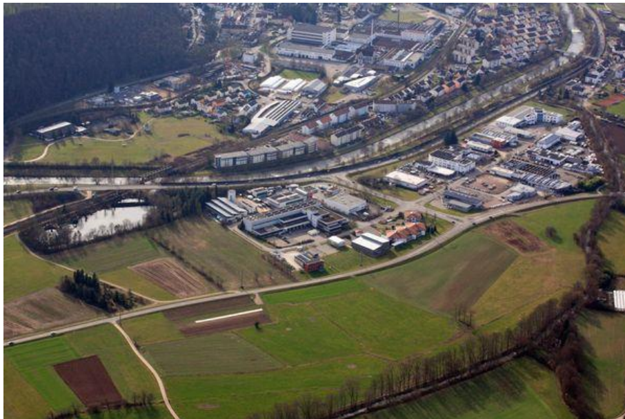
Februar 2016