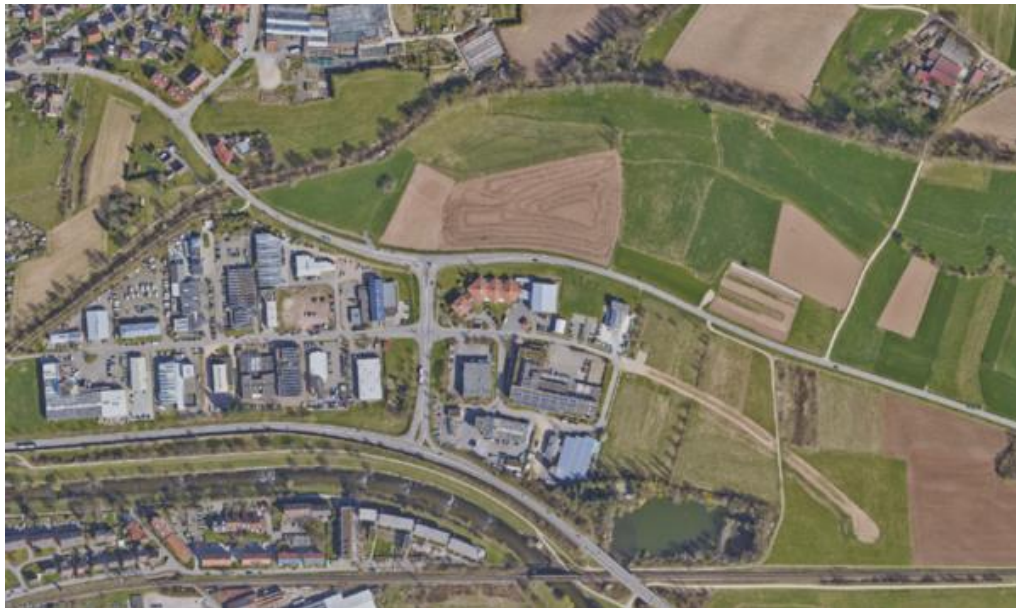
2017 Orthofoto mit erkennbarer Erschließung Entenbad-Ost

The development measures were started in 2016: