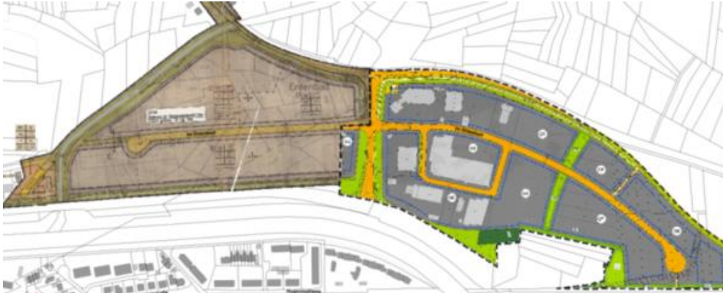
Bebauungspläne Entenbad und Entenbad-Ost, Quelle: Stadt Lörrach

In July 2015, the municipal council voted in the "Entenbad East" development plan for the planned expansion of the commercial area in the form of a statute.