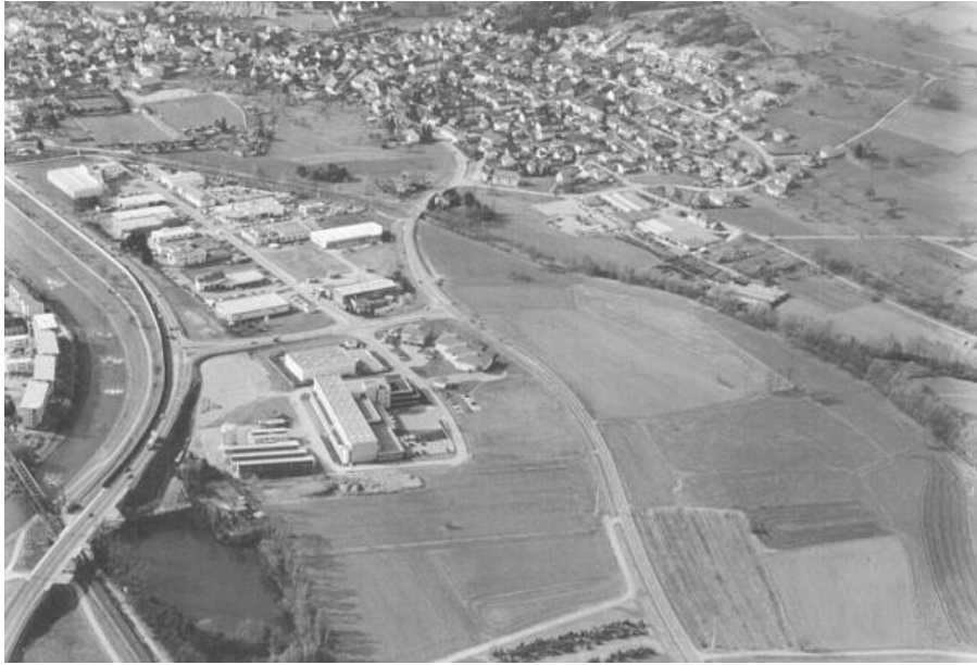
Februar 1997

Completion of the new route took place in 1994.